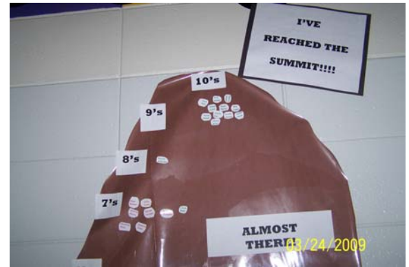
Third graders prove that hard work and lots of practice pays off as they reach the summit of Multiplication Mountain.