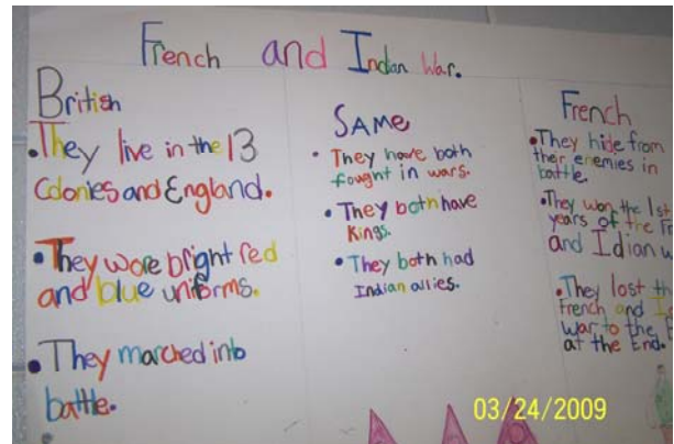
Fourth graders compare and contrast sides in the French and Indian War.