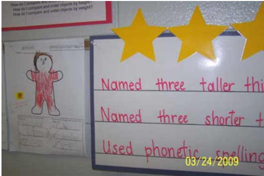
Kindergarteners write about things that are taller and shorter.